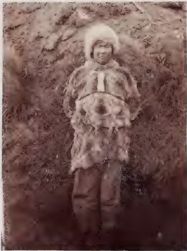
35. Esquimaux leaning against Kashima.